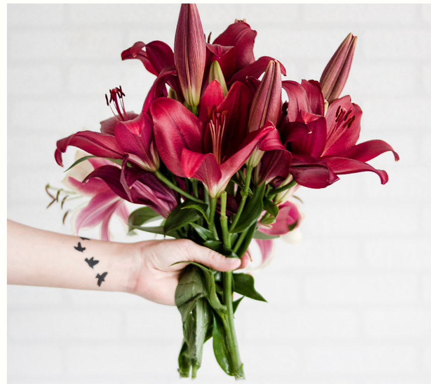
Hands Holding Flowers