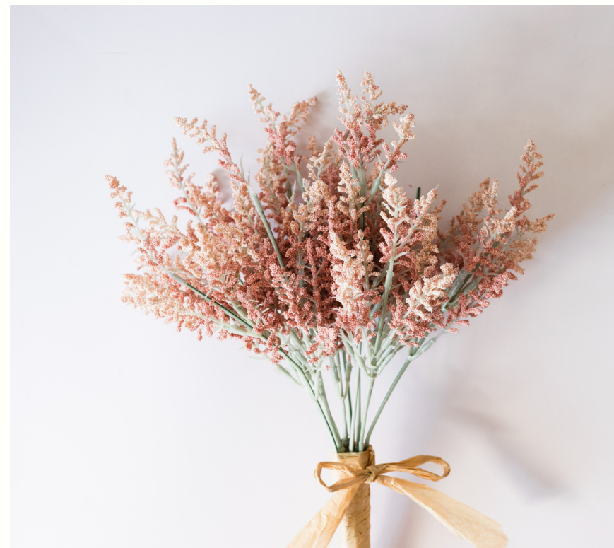
Lighting Natural / artificial Main emphasis is natural daylight