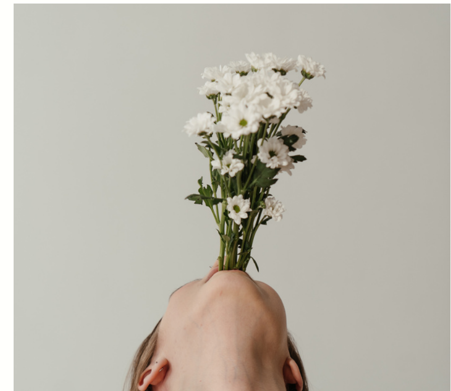
Creative Be fun