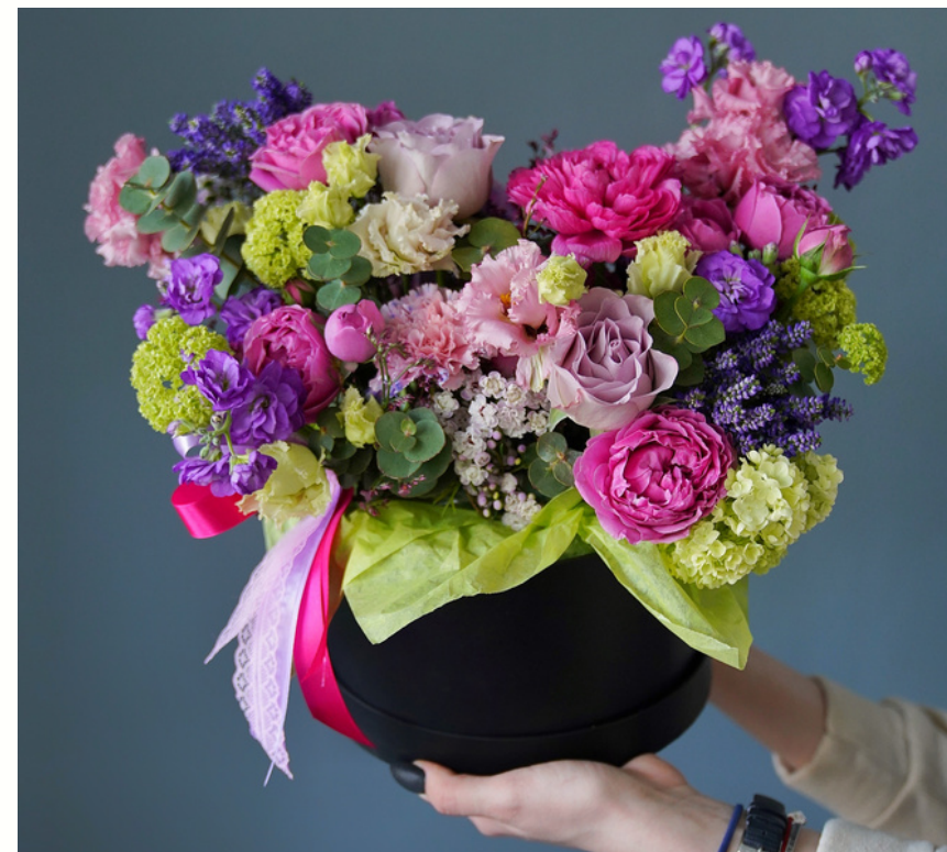
Background Bold v's Simply