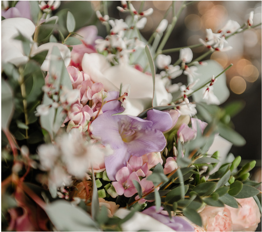
Detail Close up into the subject, looking for texture and form