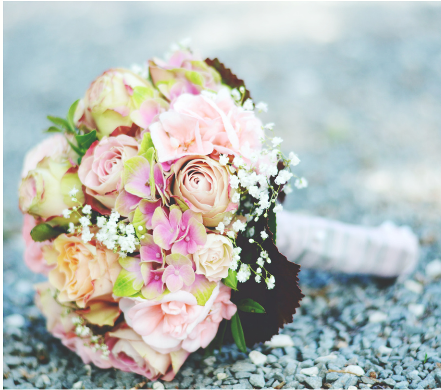
Wide Full subject in the frame