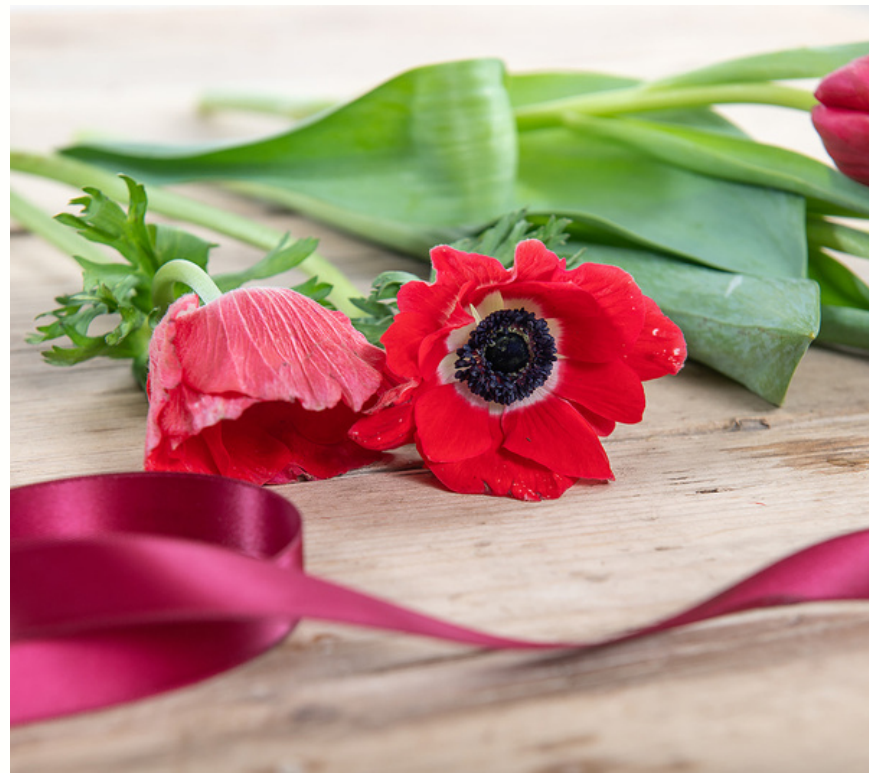
Showcase the material