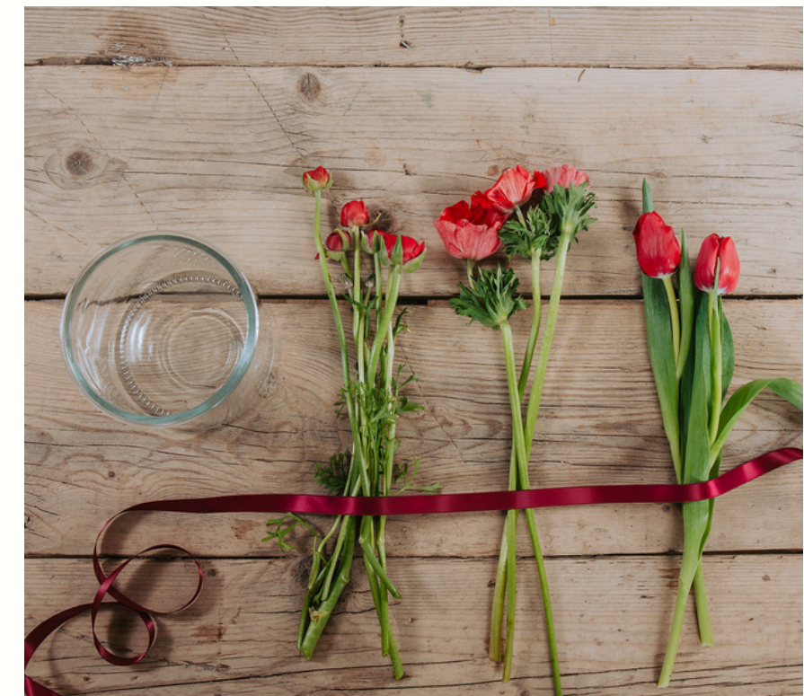
Design & Composition Angles, design ,focal length