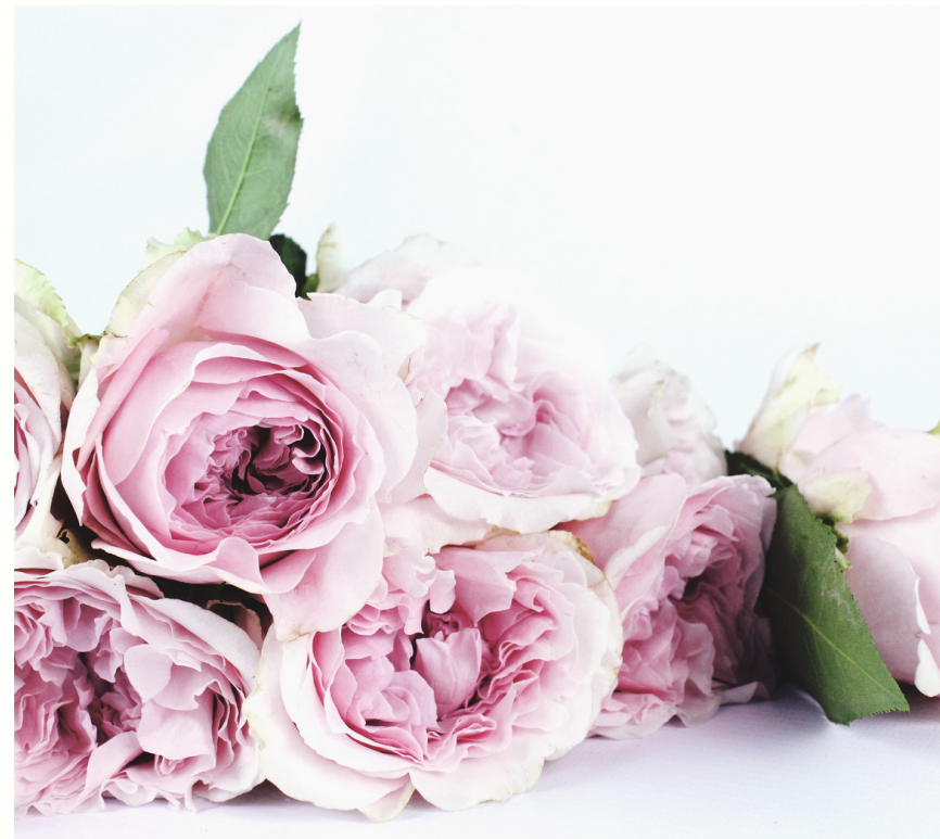
Create a Colour Pallet