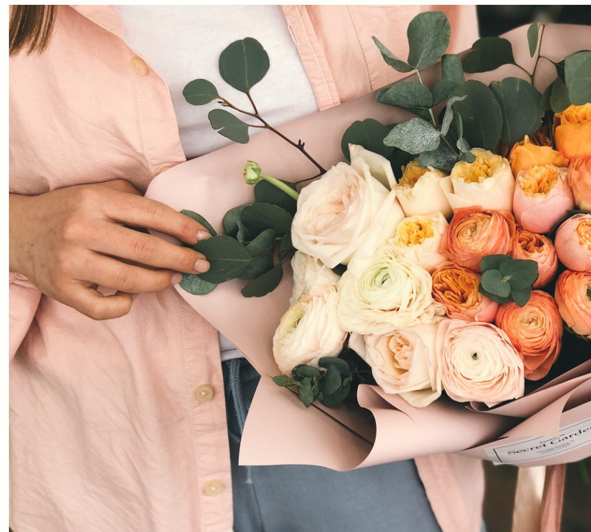
Colours Match colours of clothing