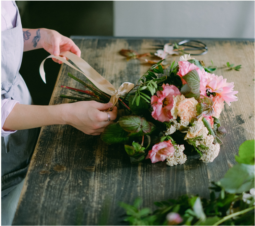
Creative / Action Shot a different angle, or even an action shot of the preparation .